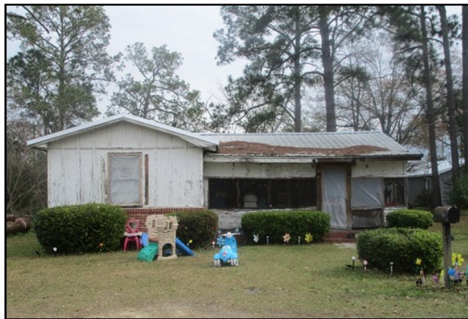
Another home in the Adel Target Area that is in need of rehabilitation.

The Cities of Adel, Fitzgerald, and Tifton each received $400,000 to provide housing rehabilitation of owner-occupied houses. The SGRC Community and Economic Development Division will administer the Adel and Fitzgerald projects.