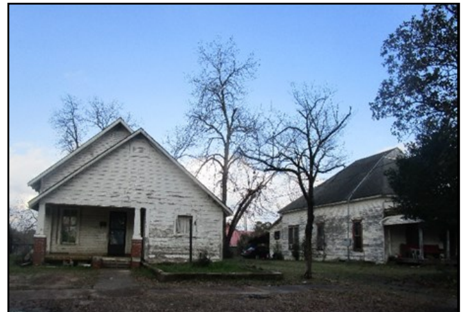
Homes within the Fitzgerald Target Area that are in of rehabilitation.