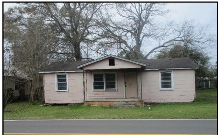
A home in the Adel Target Area that is in need of rehabilitation.

The Cities of Adel, Fitzgerald, and Tifton all have areas of low-moderate income residents that live in substandard and dilapidated housing. Families in these areas will now be given the opportunity to improve their quality of life through housing rehabilitation and renovations that will create a safer and more affordable living environment.