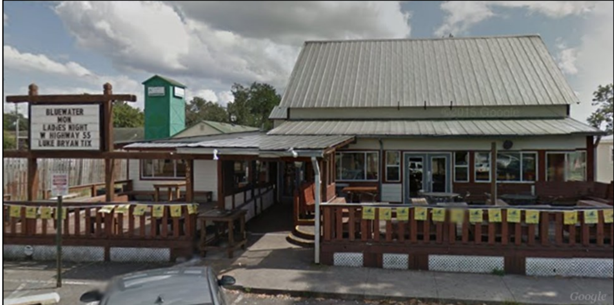
BlueWater Valdosta located in Remerton

BlueWater Valdosta has been a mainstay college bar operating successfully in Remerton for over twenty years. Remerton, once known as Mill Town, is a small municipality entirely landlocked by the City of Valdosta and located just a few miles from Valdosta State University's (VSU) main campus. This area is a popular place for VSU students to live and socialize. It is home to shops, bars, and restaurants where students hang out. BlueWater Valdosta is one of a few businesses with live music performances, DJ-played music for dancing, and all types of beer, wine, and liquor. It is a full-service bar. The current owner, Blain Nobles, took ownership and management in early 2019. Through his leadership, BlueWater weathered the 2020 pandemic very well.